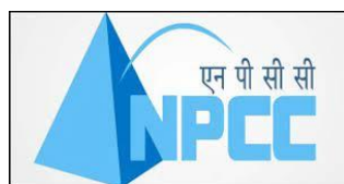
National Projects Construction Corp. Ltd.