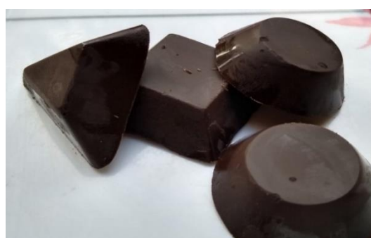
Spirulina (algal super food) fortified chocolates