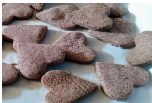
Ragi fortified cookies

The approach implemented has been capacity building of stakeholders, especially tribal women and their empowerment through Self Help Group (SHG) formation and promotion of innovative activities such as nutrient fortification and processing of food products such as ragi cookies and spirulina chocolates (Picture 1) for income generation along with providing support and market linkages to promote their products.