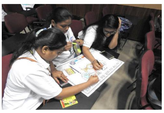
Students making posters to raise awareness about plastic pollution