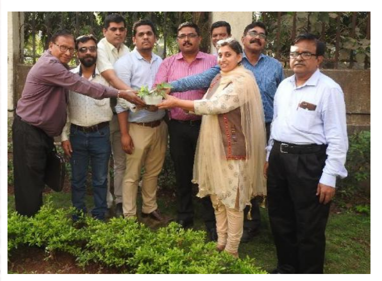
Saplings collected during Treasure Hunt by the participants