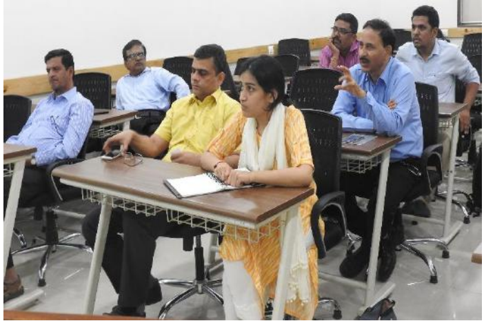
Participants expressing their views on Plastic Pollution and counter measures to plastic pollution