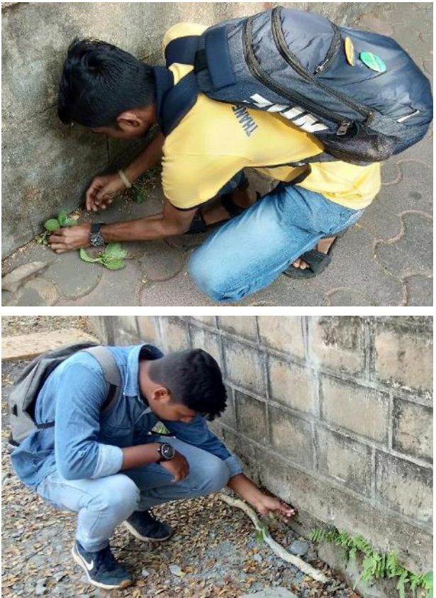
Treasure hunt for native tree saplings by the participants