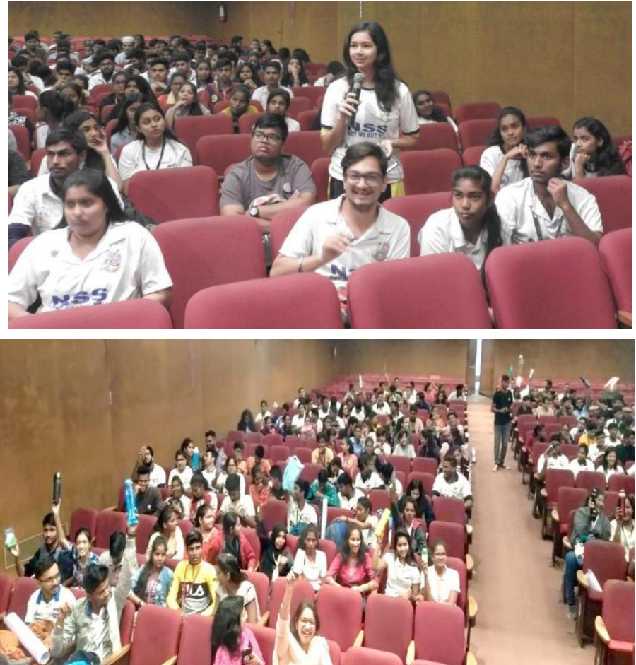
Participants showing reusable alternatives to single use plastics, which they carry with them to reduce the dependence to single use plastics

Participants during the interactive session