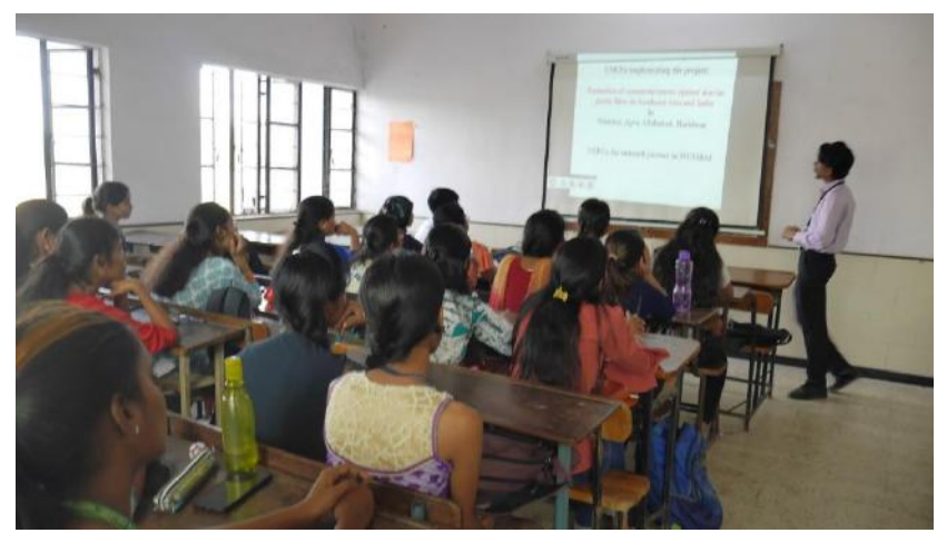
ToT session held at KBP College on 9/12/19