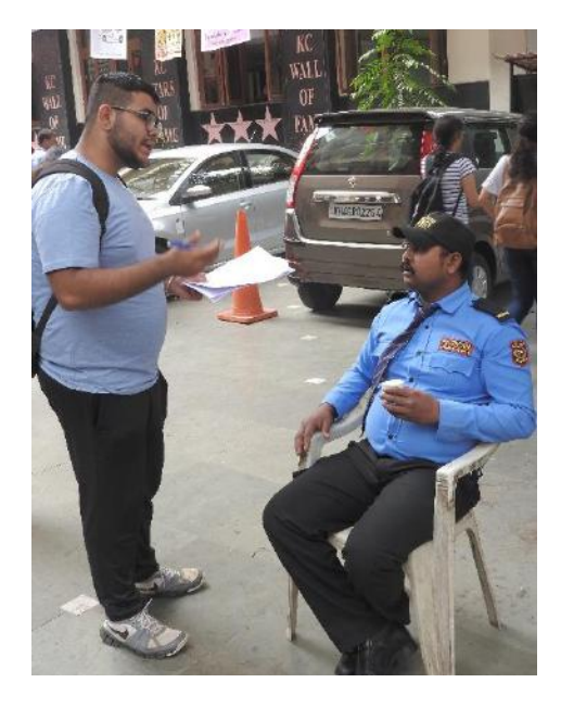
Students conducting perception survey in the campus