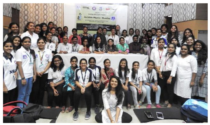
Group photo with all participants