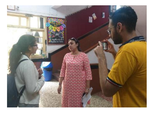
Students participating in Mobile Videography activity and interacting with college staff to gather their perception about plastic pollution