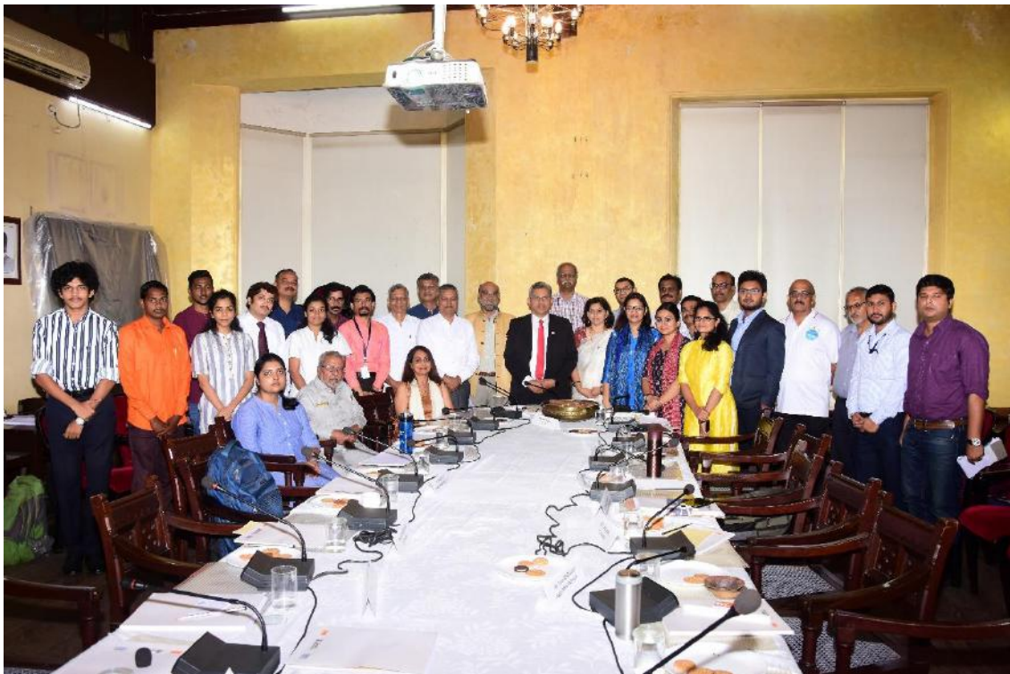
Picture No. 8: Discussion during Round Table Discussion ( top ) and Group photo after the session ( bottom )