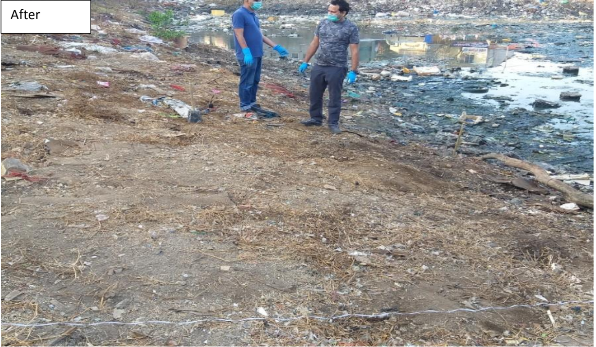
Picture No. 9: Before and after scenario: Cleanup activity at Charkop, Mumbai