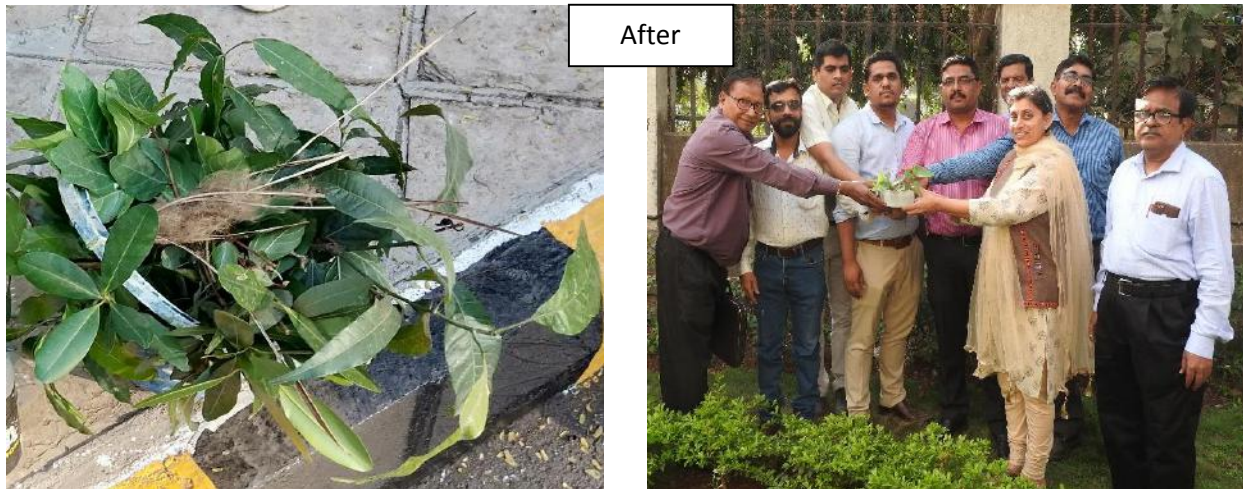
Picture No. 12: Before and after scenario: Treasure Hunt for saplings of native trees