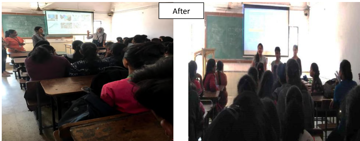
Picture No. 10: Before and after scenario: Awareness Programmes and training of Trainers (ToT)