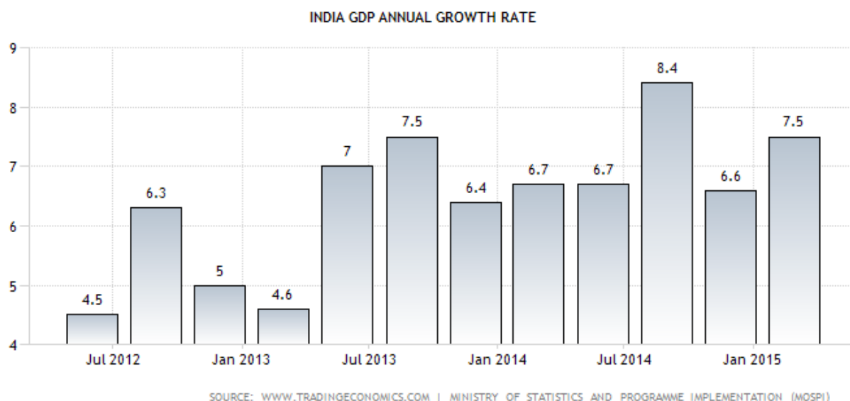
Figure 4: India GDP Annual Growth Rate (Quarterly Figures)

Further, in the General Budget for 2014–15, a host of measures inter alia ,opening up of more sectors for FDI, plans to accelerate manufacturing growth, and facilitating investments, would give a push to the economy. The GDP growth for fiscal 2014–15 has been projected in the range of 5.4%to 5.7%, with the subsequent achievement of 7%–8% in the next three to four years (Figure 4).