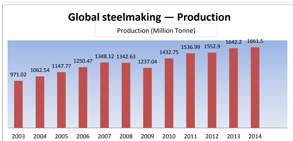
Figure 1: Worldwide Production of Crude Steel between 2003 and 2014