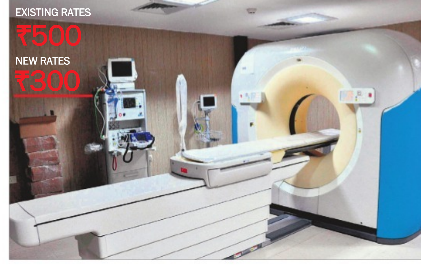
The CT scan centre at the GMCH-32 is under trial.

The centre is currently under trial (having performed tests on over 20 patients in the past couple of days). It will become operational in January (2014). The service until now was available via a centre running on a public private partnership mode where the costs were 40 per cent higher (Rs 500 for head) than government hospital rates and the condition of one poor-free test per 10 poor patients existed. Now, the cost will be lesser and the waiver for poor patients will no longer be