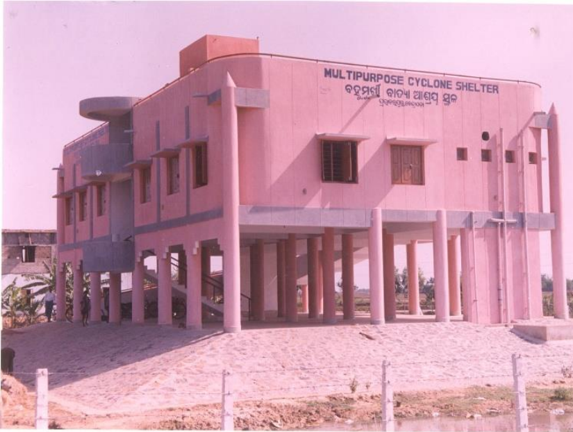
Multi-purpose cyclone shelter