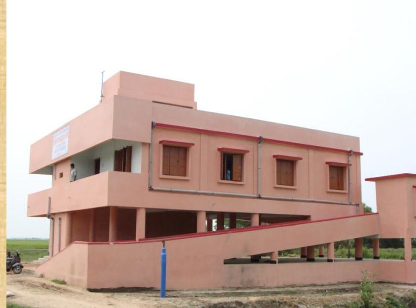
Multi-purpose flood shelter