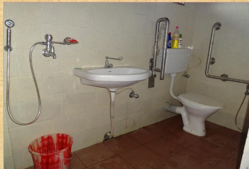
Persons with disability friendly toilet in MCS