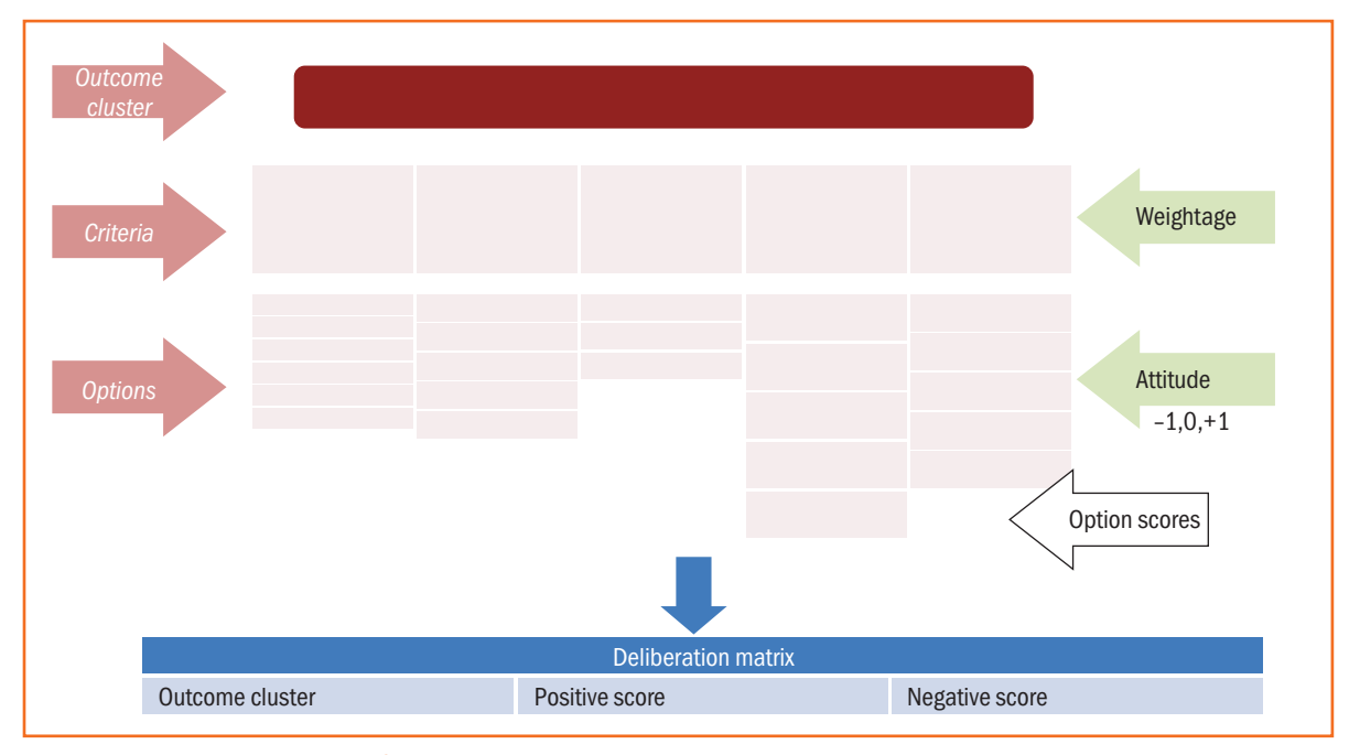
FIGURE 1: General scheme of the approach

Users can assign weightage for each criterion within an outcome cluster along with attitudes towards various options - acceptable (+1), indifference (0), and not-acceptable (-1). A proposed NAMA is mapped against these options in terms of qualitative and/or quantitative scores, expressed numerically as per the scoring guide. These scores are aggregated for outcome clusters. Since it is advised not to reduce impacts of an action to a single score, and at the same time also recognize that some degree of aggregation is necessary for making the criteria accessible and useful, it is proposed that each outcome cluster is given two scores — one signifying the qualitative strength of positive impacts and other recognizing negative impacts. This is achieved by aggregating the option scores as per the sign of attitude, i.e., positive or negative. Accordingly, each outcome cluster gets positive and negative scores, in a deliberation matrix. The deliberation matrix of various NAMA proposals can be used to ascertain their eligibilities, acceptability, and categories. Moreover, the negative scores also provide an indication of modification of NAMA design. It is important to note here that the user may add or delete more criteria and corresponding options within each outcome clusters.